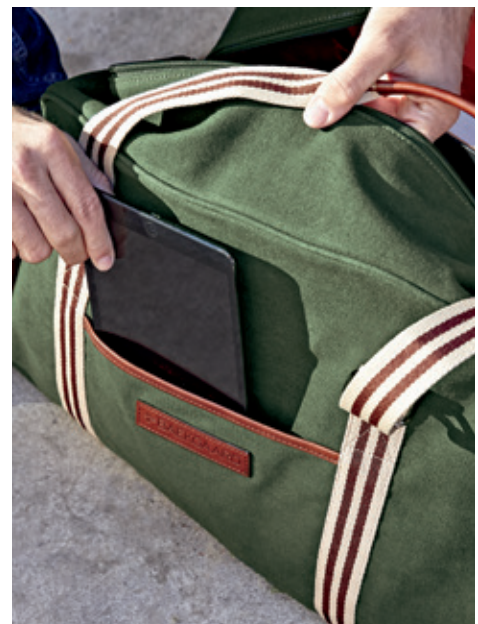
Also available in our Team Pride Collection. See page 19 for details.

roomy interior give you enough room to pack for the gym, or a long weekend. Trimmed with Italian leather. Available in cotton canvas or brushed microfiber.